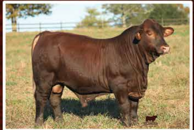
Performance Tested Bulls For Sale