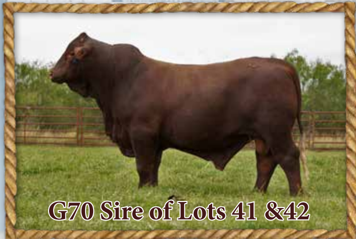
G70 Sire of Lots 41 & 42

Balanced Index: 85% | Cow/Calf Index: 90% | Terminal Index: 80% Another Stout open heifer she is sired by our Gray Oaks Farm polled bull and her dam goes back to Shaker Hill Sierra genetics. Take this heifer home and bred her to the bull of your choice.