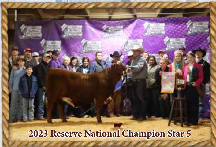
2023 Reserve National Champion Star 5

What a group of 31 Star 5 registered Red Mott open heifers. We have taken the best in Santa Gertrudis genetics and crossed with our Hereford Cow herd. This calf crop of heifers has produced Star 5 Sale toppers at the recent Banners & Buckles Sale in Jackson, MS and a group at the Purple Reign Sale in Arkansas. On the show side we produced this years Reserve National Champion Star 5 female sired by RDF Never Sank daughter that topped the Banners & Buckles Sale at $15,000. Whether you are looking for your next Star 5 show prospect or Commercial replacement females, these Red Mott females will make it happen!