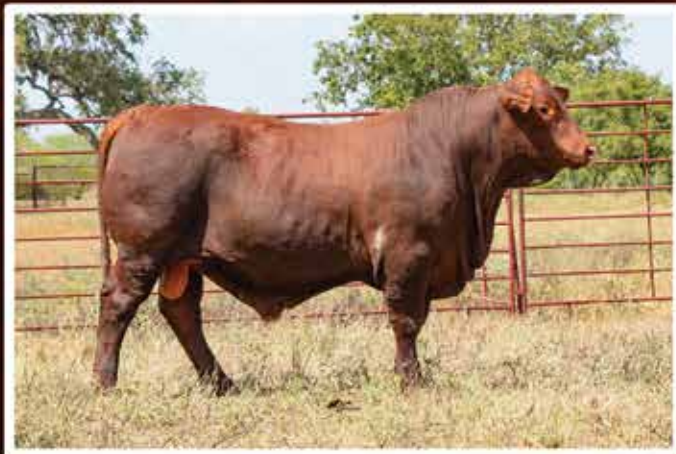
Herd Sire SR 634F1