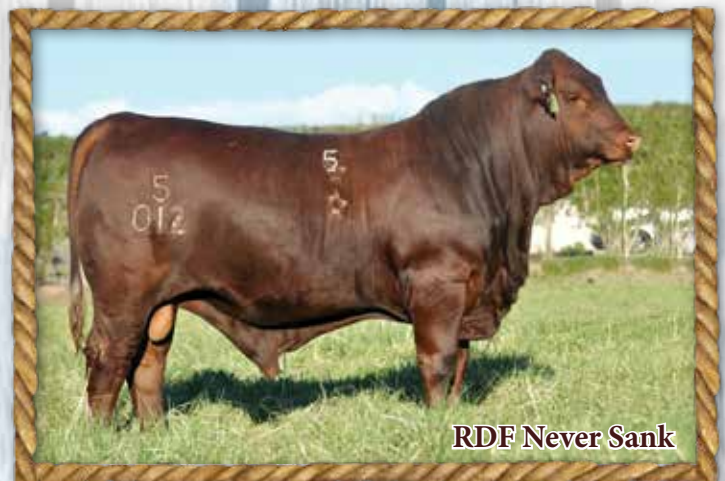
RDF Never Sank