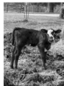
Star 5 Show Prospects