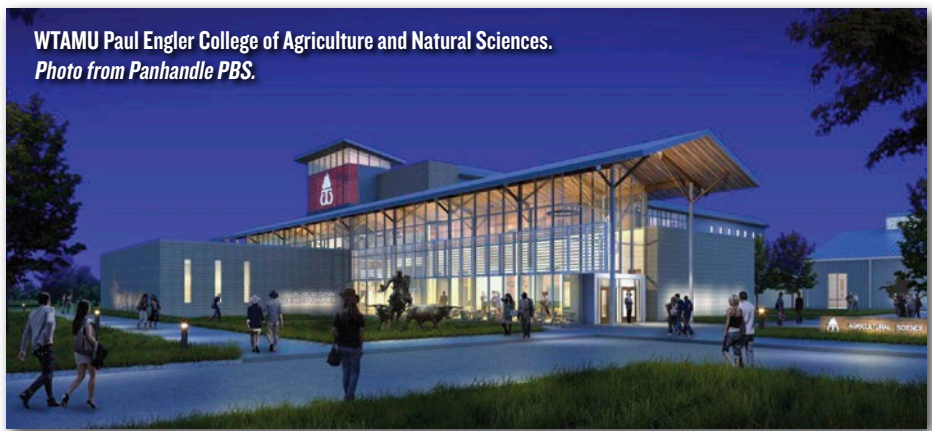
WTAMU Paul Engler College of Agriculture and Natural Sciences.